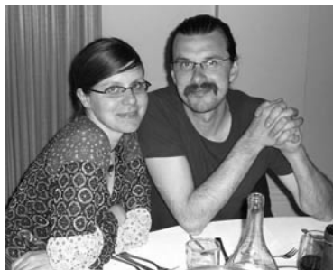
Anne Provoost & husband